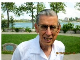
IN THE CARE OF