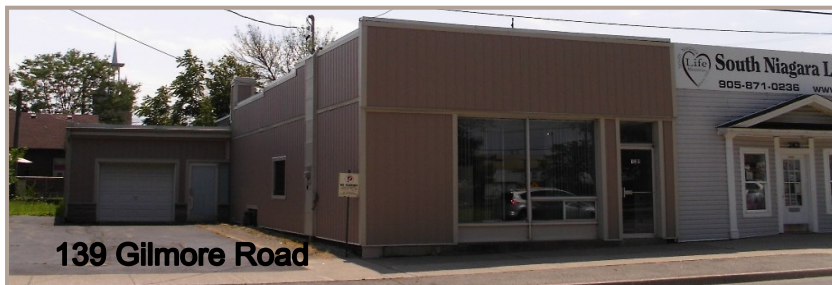
139 Gilmore Road

Expansion Opportunity —new space is being offered for SNLM to buy.